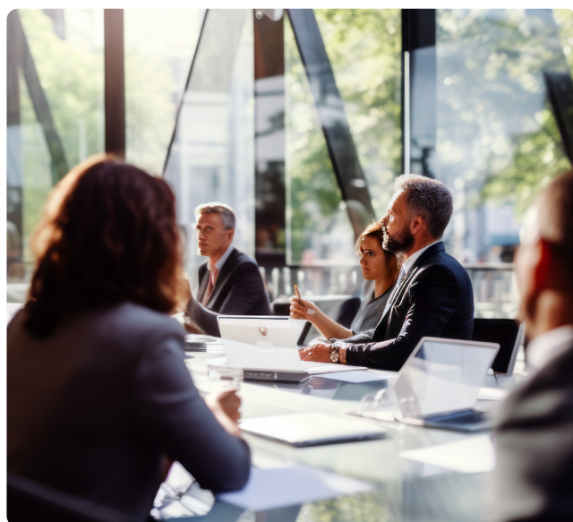
Image created using AI with the prompt: "People attending a Core Copilot workshop, photographed through glass, natural lighting, 4k"